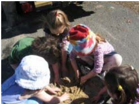
More helping hands mixing the clay with the sand