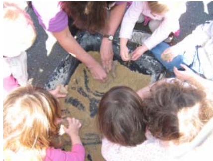
Mixing the clay with the sand to "insulate" the Matzah Oven