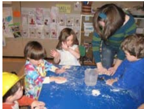
Experimenting with Gluten-Free Matzah