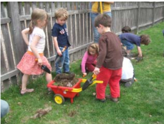
Removing some dirt