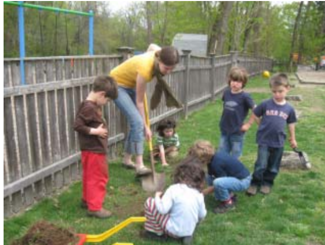
As we like to say at Gan Keshet, "Teamwork makes the dream work!"