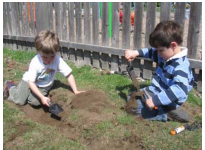
Using our gardening tools